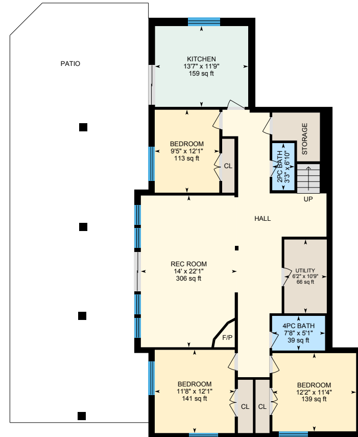
Lower Exterior Area 1569.67 sq ft