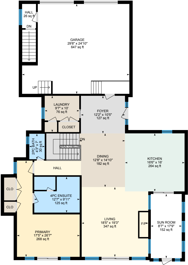
Main Floor Exterior Area 1817.74 sq ft

Main Building: Total Exterior Area Above Grade 1817.74 sq ft